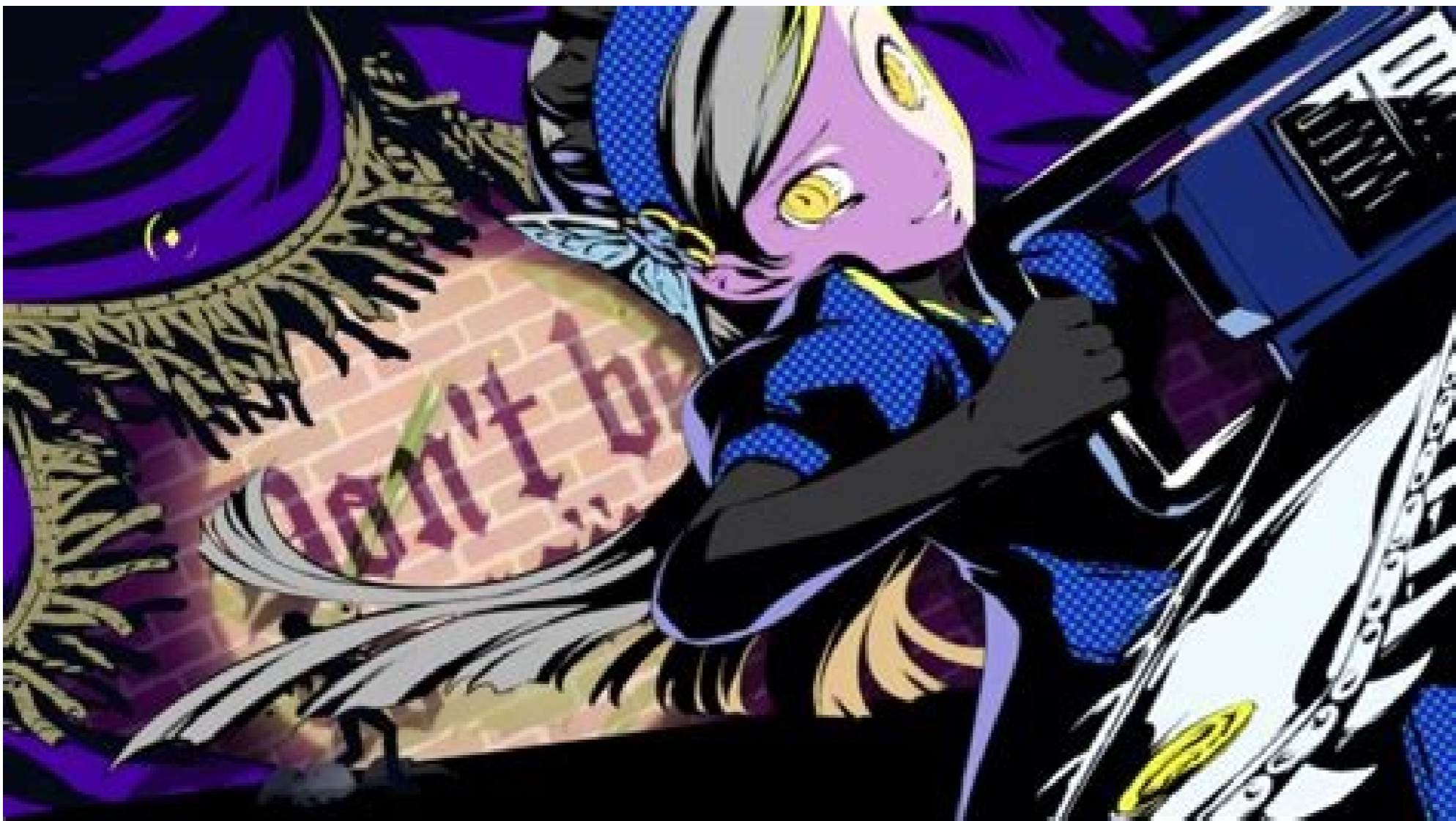
Persona 5 futaba palace recommended level. How to beat futaba palace boss. Best personas futaba palace.